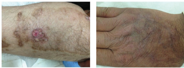
Figure 3: The Disappearance of the Lesions after Acitretine Therapy