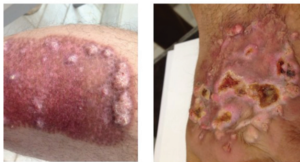
Figure 1: Multiple Hyperkeratotic Papules and Crateriform Nodules on the Graft Site

squamous epithelium at the sides and bottom of the lesion. There was a central keratin-filled crater. The component cells had a distinctive eosinophilia due to their cytoplasm and epithelial atypia and mitoses were not seen (Fig 2).